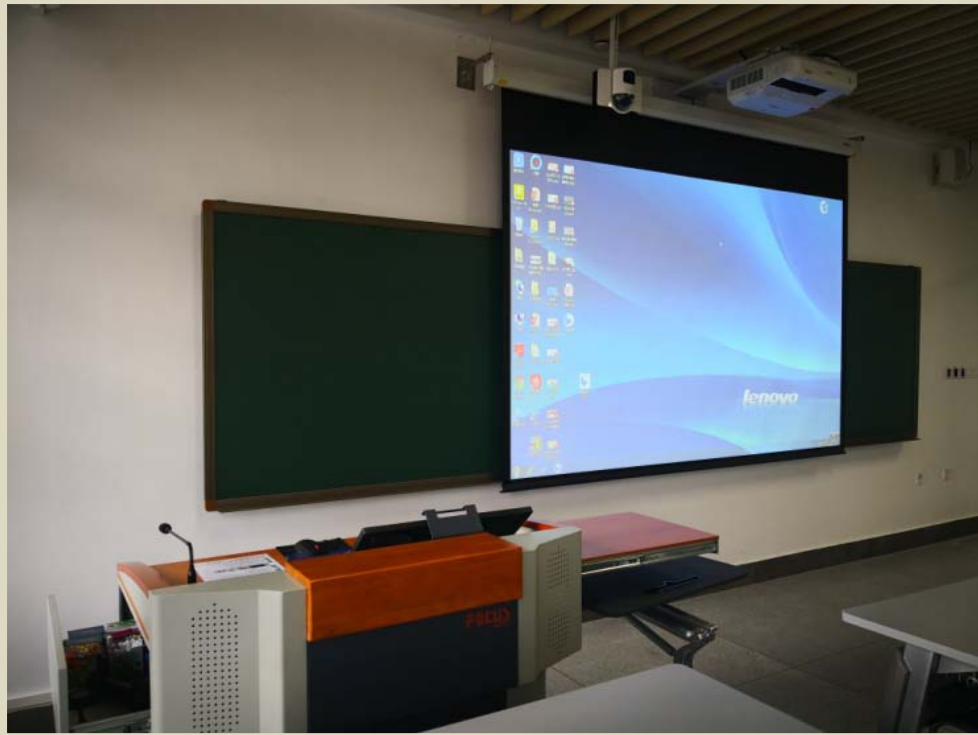
Multi-media facility in the classroom