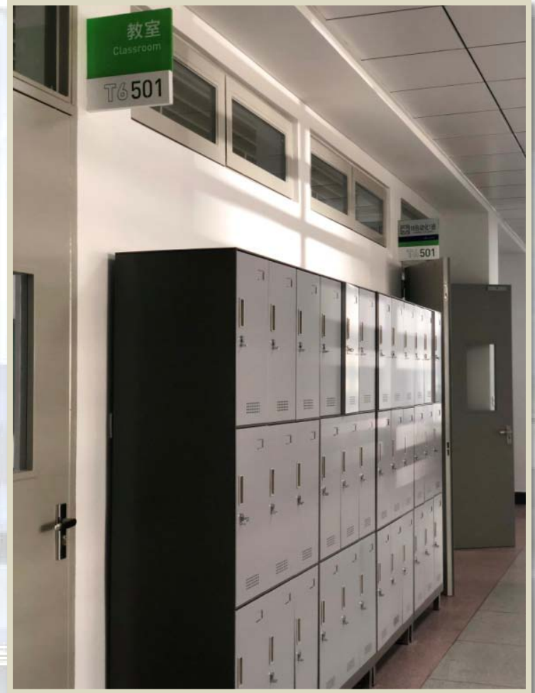
Lockers for students use outside classrooms