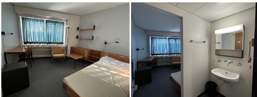
The dormitory room

I have applied for dormitory provided by the school. The dormitory is located in Olten, inside a local hospital. The dormitory is a one-room style dormitory, which each student gets their own room. The toilet, shower room and kitchen are located outside the room in a shared space, but it is very convenient as each floor has its own facilities prepared. The kitchen is also equipped with a lot of things such as pots and pans, cutlery, cups and bowls, and even a rice cooker. It is very convenient as I do not have to buy my own items. On a side note, FHNW university provides subsidies of 2500CHF for each exchange student per semester.